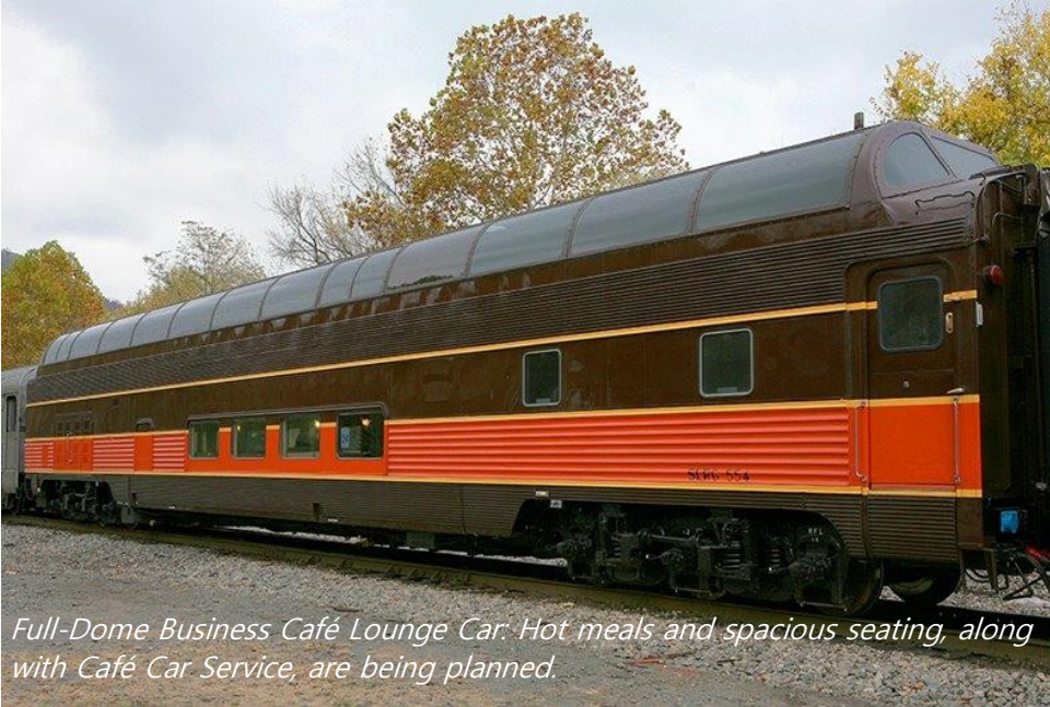
Full-Dome Business Café Lounge Car: Hot meals and spacious seating, along with Café Car Service, are being planned.