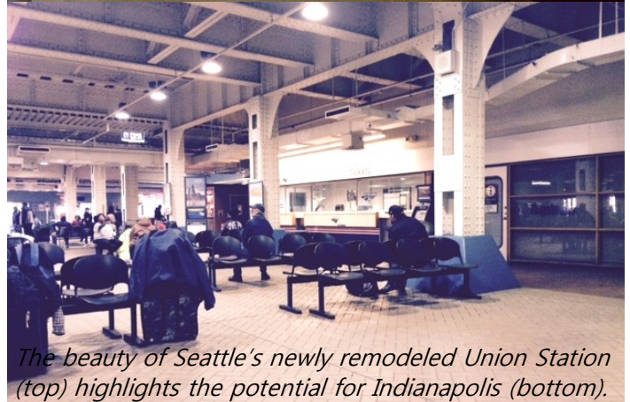
The beauty of Seattle's newly remodeled Union Station (top) highlights the potential for Indianapolis (bottom).

graded thanks to a partnership between the states of Oregon and Washington. Running times are improving, as a result. TALGO Trains operate on some of the runs.