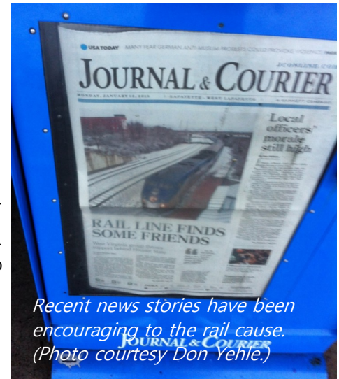
Recent news stories have been encouraging to the rail cause.

The Connersville News Examiner interviewed Coxhead about extending the Hoosier State corridor. (continued)