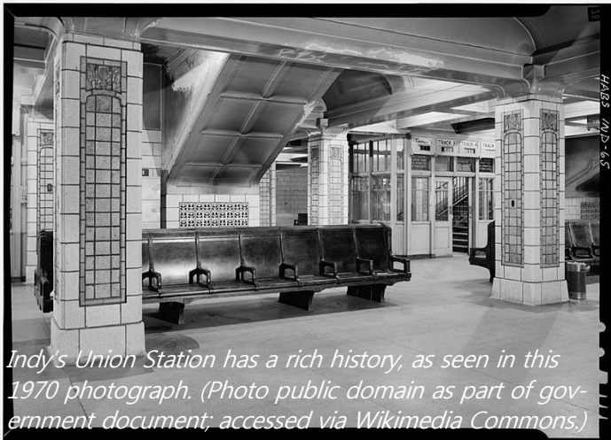
Indy's Union Station has a rich history, as seen in this 1970 photograph.

("Union Station" continued from page 7) All Aboard Indiana on January 23 that the repairs needed to Union Station (which houses the Amtrak Greyhound transit center at 350 S. Illinois Street in Indianapolis) will be made.